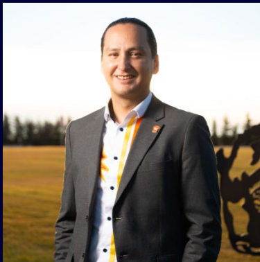
Chief Cadmus Delorme Cowessess First Nation