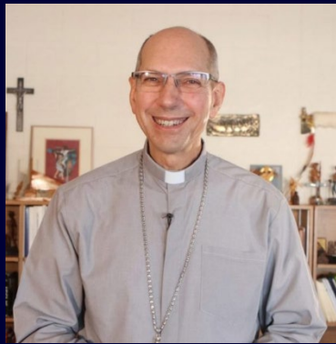
Archbishop Donald Bolen Archbishop of Regina